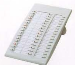
■ KX-T7740 DSS Console