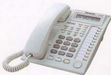
■ KX-T7730 LCD, Speakerphone Unit

* An optional card is required. Please contact your dealer or phone company to confirm if the Caller ID service is available in your area.