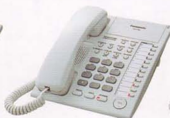
■ KX-T7720 Speakerphone Unit