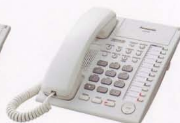
■ KX-T7750 Monitor Unit